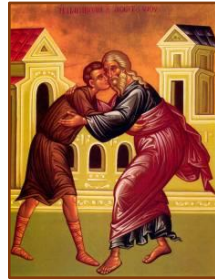
Sunday of the Prodigal Son

Keep up on OCA news by visiting www.oca.org , diocesan news and directives by visiting www.nynjoca.org , and parish news by visiting www.orthodoxbrick.org .