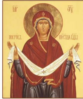
Protection of the Most-holy Theotokos

Keep up on OCA news by visiting www.oca.org , diocesan news by visiting www.nynjoca.org , and parish news by visiting www.occa-brick.org .